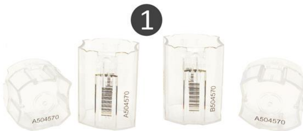
Figure 5. Image of the outer sample containers