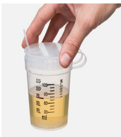
Figure 2. 90 millilitres sample collection

Remove the collection vessel from the plastic packaging, before providing a sample detach the ring pull from the top of the lid. This prevents unnecessary spillage when the collection vessel has been sealed. The athlete must provide a sample of 90 millilitres minimum as shown in figure 2. This should be carried out with the DCO's present and in sight.