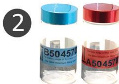
Figure 3. Image of both sample containers

Once the sample has been provided in the collection vessel the athlete is to split the sample between bottles A & B as indicated on figure 4.