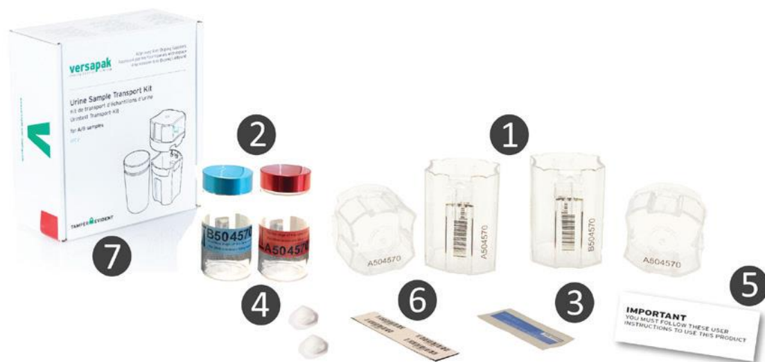
Figure 1. Contents of Versa pack sample Test kit.

Remove the collection vessel from the plastic packaging, before providing a sample detach the ring pull from the top of the lid. This prevents unnecessary spillage when the collection vessel has been sealed. The athlete must provide a sample of 90 millilitres minimum as shown in figure 2. This should be carried out with the DCO's present and in sight.