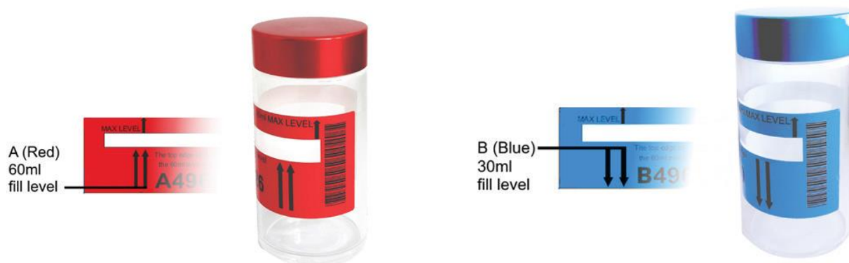
Figure 4. Image of bottle A and B to indicate amount required.

Once both bottles A and B have the required amount of urine in them the lids can be securely screwed on and the bottles are to be placed in the security canisters as shown in figure 5. Ensuring that the caps of the sample bottles have been sufficiently tightened. Place the bottle marked A UPRIGHT in the A canister and the bottle marked B UPRIGHT in the B canister.