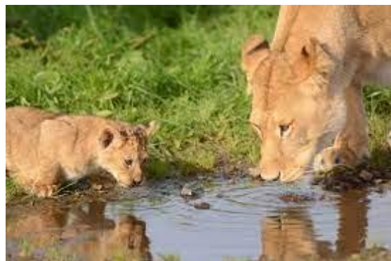
Woburn Safari park