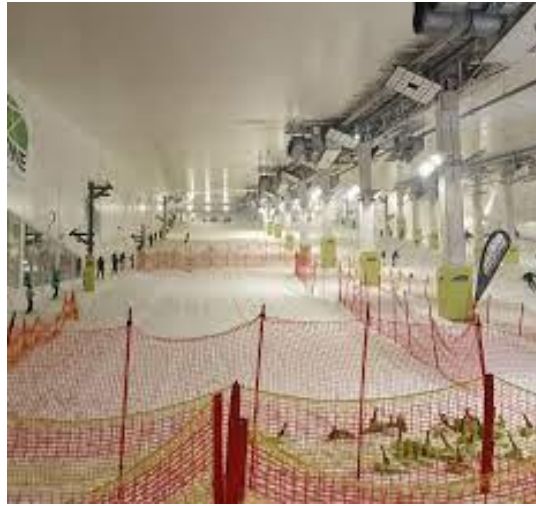
SNOWZONE Milton Keynes