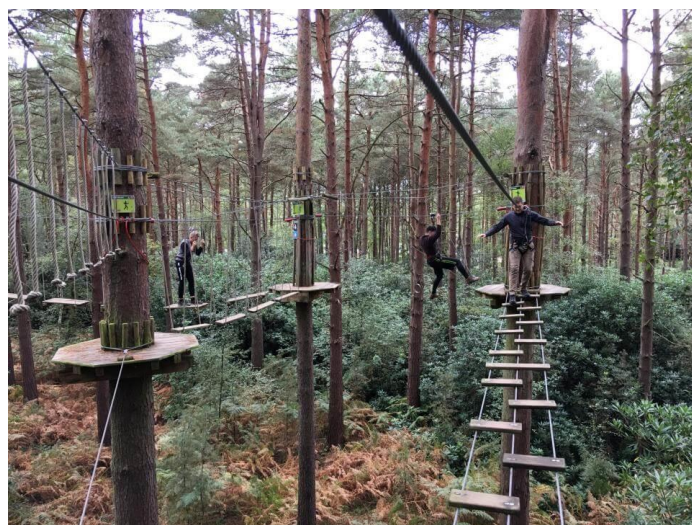
GO Ape Wenderover Woods