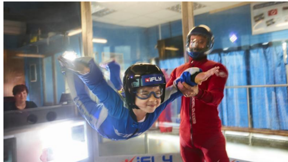
Xscape Skydiving Indoor Centre