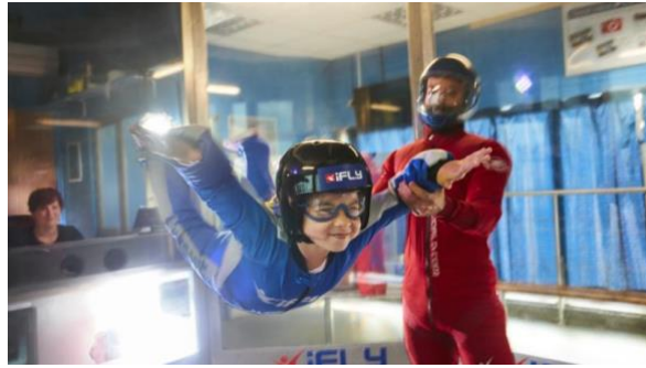
Xscape Skydiving Indoor Centre