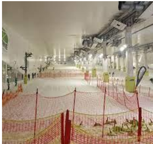
SNOWZONE Milton Keynes