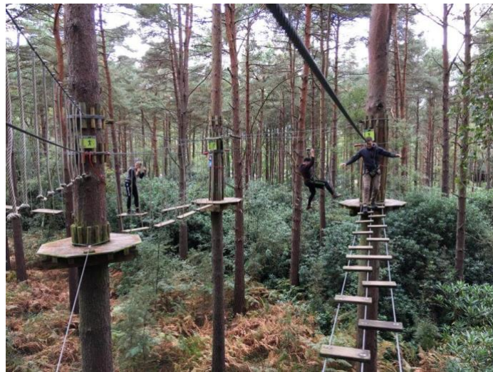
GO Ape Wendover Woods